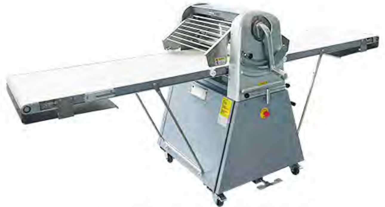
Vertical dough sheeter machine