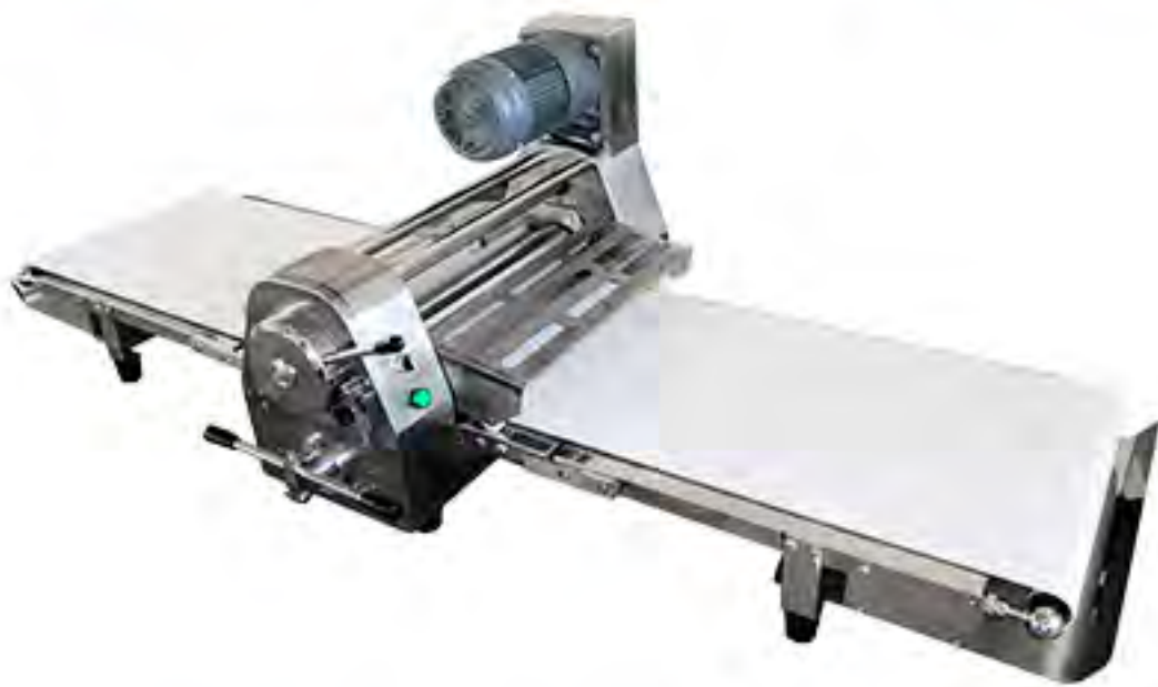
Desktop dough sheeter machine